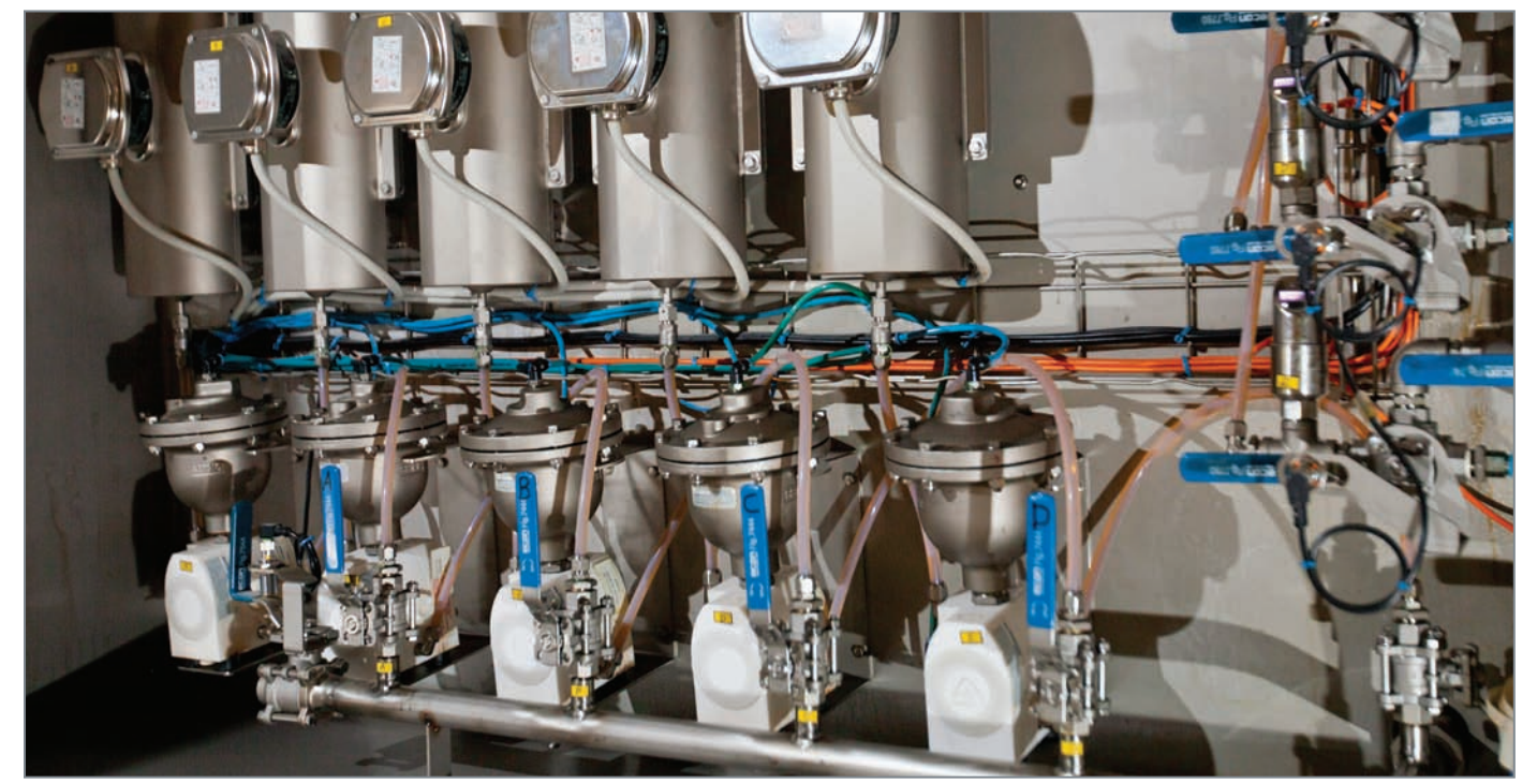
Recently, Technology Unlimited was tasked with fashioning a system for one of Europe's largest animal-feed producers that would inject an enzyme consisting mainly of palm oil onto the exterior of goat feed. The system requirements demanded a dosing pump that would be able to meet all the various operational parameters for temperature, pressure, speed and flow rate.

feed producers that would inject an enzyme consisting mainly of palm oil onto the exterior of goat feed, an operation that is critical in producing feed that finicky goats won't turn their noses up at.