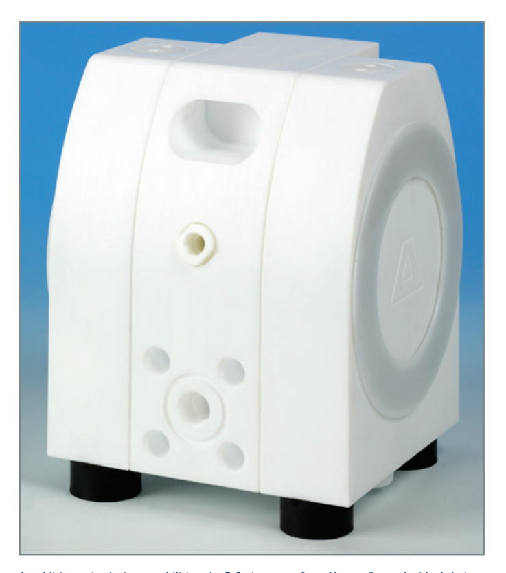
In addition to its dosing capabilities, the E-Series pump from Almatec® was the ideal choice for the enzyme-dosing application because it features a solid-body design and is constructed of PE, which offers excellent corrosion-resistance.

Other significant features of the E-Series pumps include the patented maintenance- and lubrication-free PERSWING P®