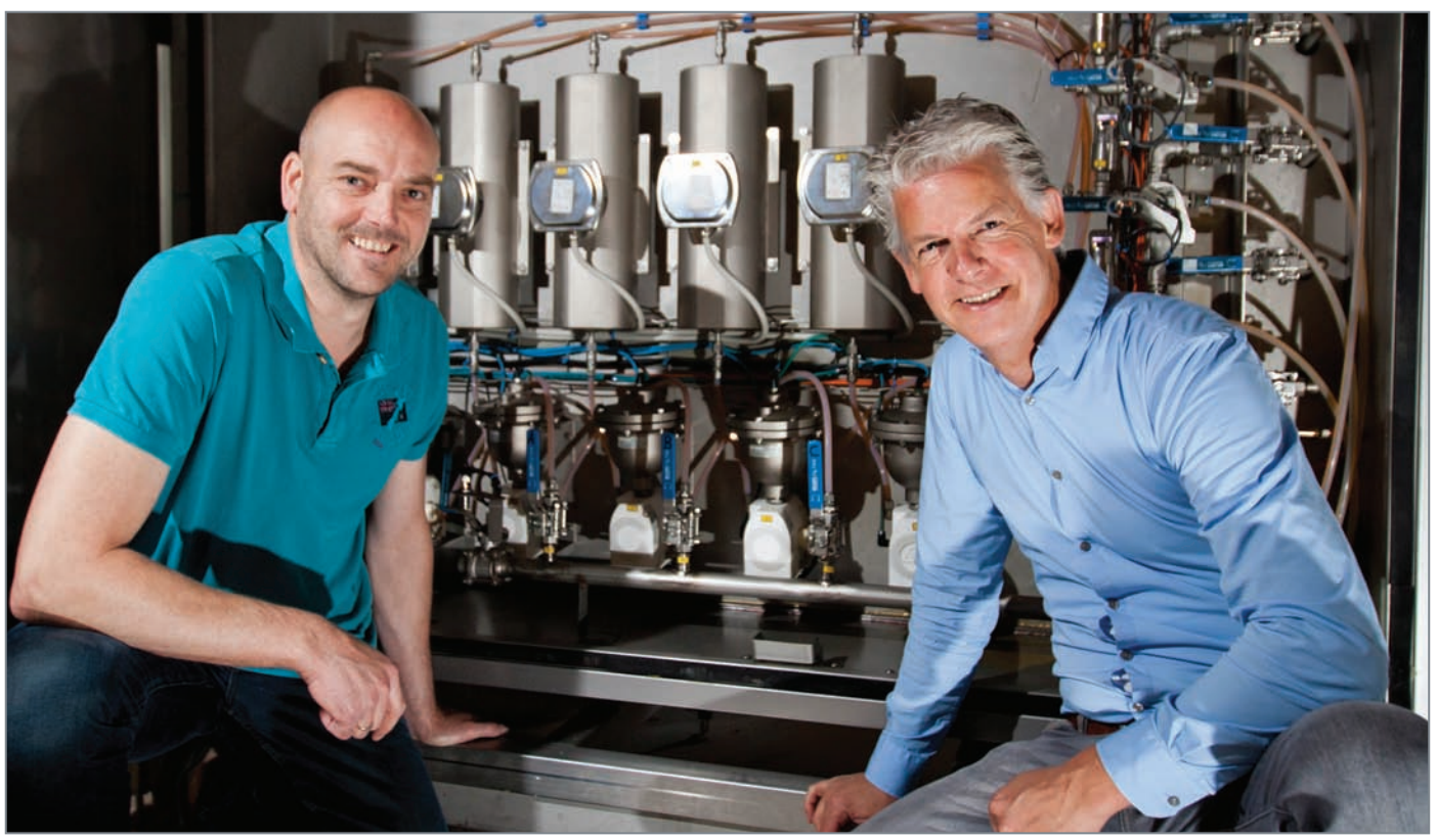
When Technology Unlimited - The Netherlands-based creator of customized stainless-steel systems, solutions and components used in the manufacture of animal feed and other food products – needed to find a reliable pump for dosing enzyme at a highly accurate rate, the company turned to pump distributor Holland Air Pumps for help. After discussing the situation with Technology Unlimited, Holland Air Pumps knew it had the perfect answer for the challenge: E—Series AODD Pumps from Almatec®.

While it may not be the most significant philosophical discussion of our time, there does seem to be quite a bit of disagreement regarding the eating habits of goats. On one side, many will argue that goats are actually very particular about what they ingest and will not devour everything in their path. On the other hand, there is a faction that insists that goats are walking trash compactors that will eat anything, up to and including tin cans.