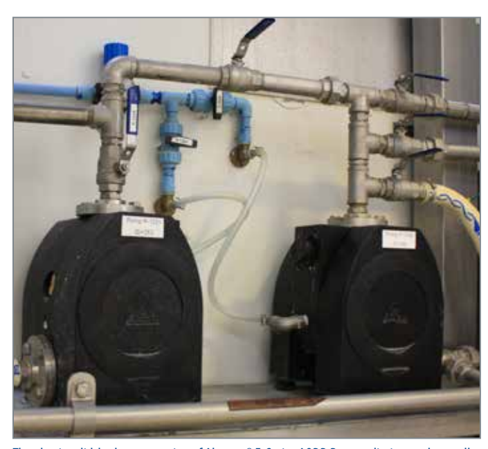
The plastic solid-body construction of Almatec® E-Series AODD Pumps eliminates the small crevices or cavities that can be found in injection-molded models. It is in these crevices that liquids can accumulate and leak paths can be created.

However, keeping these dangerous chemicals fully contained is often easier said than done. Since many can also be highly corrosive, the pumping equipment used to transfer them is prone to chemical attack if the materials of construction are not compatible with the acid, caustic or solvent. Materials of construction are not the only factor to consider when determining if a pump should be used to handle dangerous chemicals. Another area to focus on is the actual design features of the pump. For example, if the design incorporates mechanical seals or packing, they may be prone to leaking.