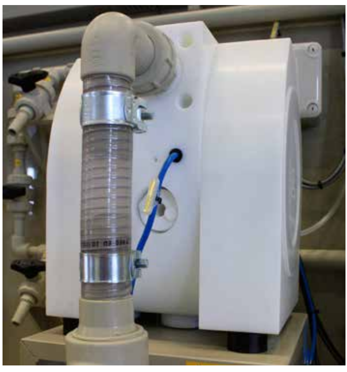
During their operation, injection-molded AODD Pumps can bounce, which can loosen pipework and increase the chances of a chemical leak. Almatec* solid-body AODD Pumps are more stable during their operation, which leads to a higher level of product containment.

That's why full containment of these hazardous, flammable or explosive substances is a front-of-mind concern for the plant operators who handle them. Those concerns can be alleviated, however, through the use of pumping equipment that has been designed to achieve full containment of dangerous chemicals. While other pump technologies can claim to do this, only plastic solid-body AODD pumps, specifically the E-Series model from Almatec, can turn those claims into reality.