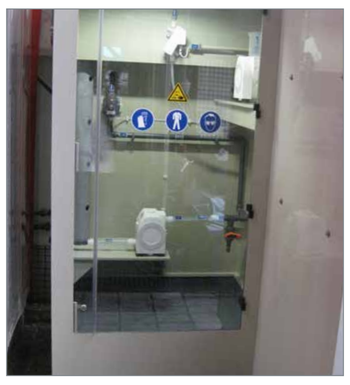
Harsh chemicals can cause compatibility concerns when used with some types of pumps. Almatec® E-Series AODD Pumps can be constructed of plastic materials that are specifically compatible with the chemicals that are being handled, which eliminates corrosion and leak

Some common pump styles that have traditionally been used to handle dangerous chemicals include lobe, gear and centrifugal models. While they may be constructed of chemical-compatible materials, their design features mechanical seals, the performance of which can be compromised over time, raising the possibility that leaks will occur.