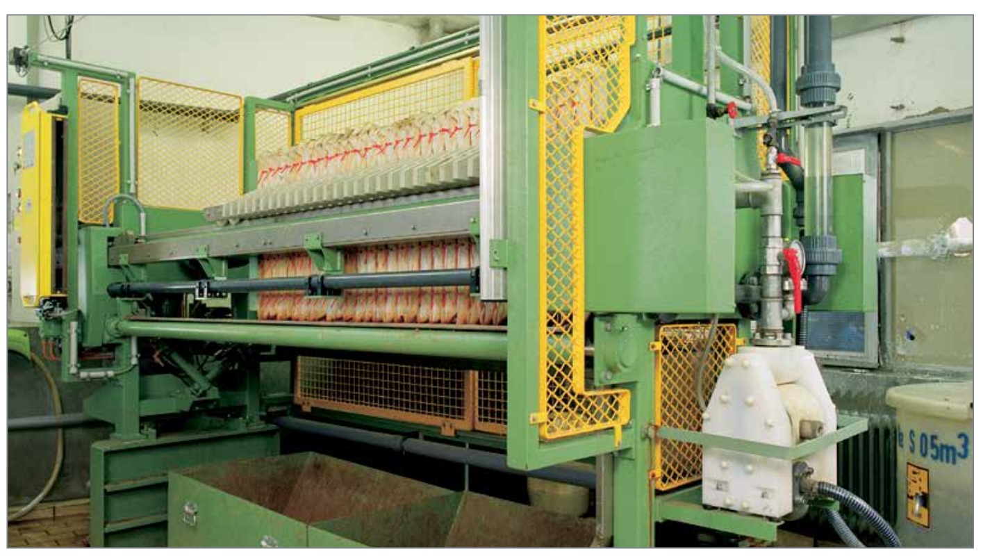
Fig 1: Functional principle of an air-operated double diaphragm pump with a feed pressure of 15 bar (Almatec AHD series).

By Peter Schüten, Almatec Product Manager