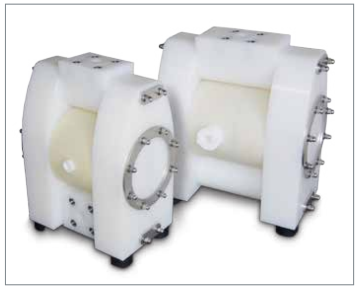
Fig. 4: High pressure air-operated double-diaphragm pumps in the series, with internal pressure conversion (Almatec AHD series), as well as the variant for use with an external booster (Almatec AHS series)

In addition, these pumps can be combined with the optional use of a sensor that responds to the movements of the diaphragm and allows the cycle to be easily monitored. Accordingly, the slow stroke frequency that accompanies a full press, rarely triggers a signal. If a PLC is used to program a time window within which a stroke should take place, a full