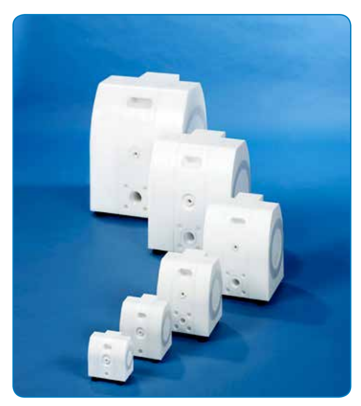
Almatec® E-Series Pumps with solid-body plastic construction safely transfer abrasive components.

It's a fact of manufacturing: abrasive liquids and compounds need to play a role in the creation of some of the world's most recognizable products. These products only get made, however, if the equipment used to produce them can meet the challenges of handling and transferring a wide range of harsh and abrasive chemicals. For three decades, Almatec has identified the challenges inherent in abrasive-handling applications and has developed and provided the solid-body plastic AODD pumping technology that is best-suited for use in these demanding manufacturing atmospheres.