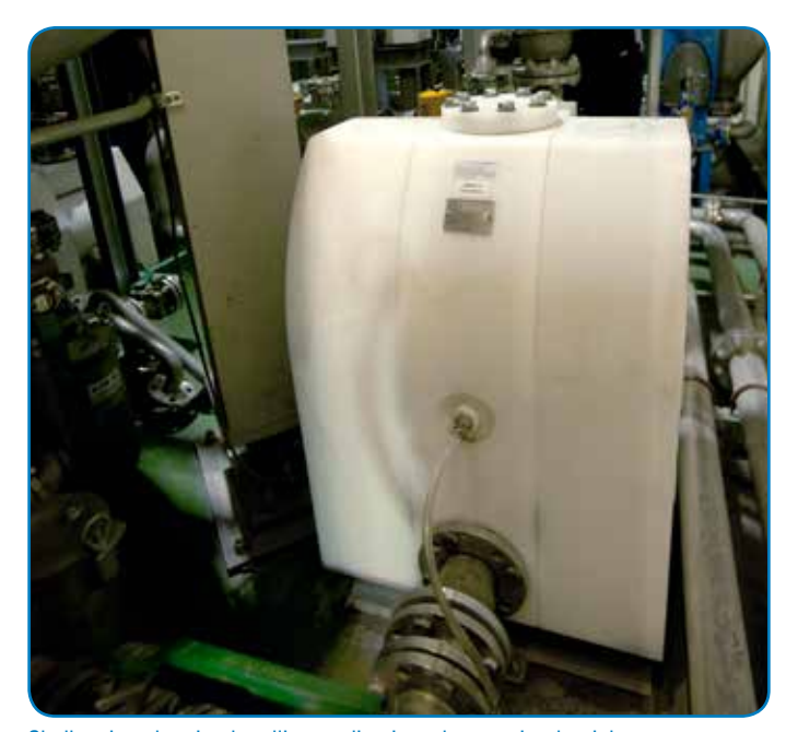
Challenging abrasive-handling applications that require the right pump technology include printing inks, lime slurry, silicone carbide slurry, ceramic mass/glaze, pickling baths and electroplating.

rust or scale that can discolor the steel. The pickling bath, or tarnision liquor, that is used to facilitate this treatment primarily consists of hydrochloric acid, though steels with an alloy content greater than 6% must be pickled in two stages—the initial hydrochloric acid stage, followed by submersion in another strong acid, such as nitric, phosphoric or hydrofluoric. Pickling is used in jewelry-making to remove the oxidation layer from copper, which occurs after heating. The waste product from steel pickling, known as pickling sludge, includes acidic rinse waters, metallic salts and waste acid, all of which make it a hazardous waste that needs to be neutralized with lime before it can be disposed of in a landfill.