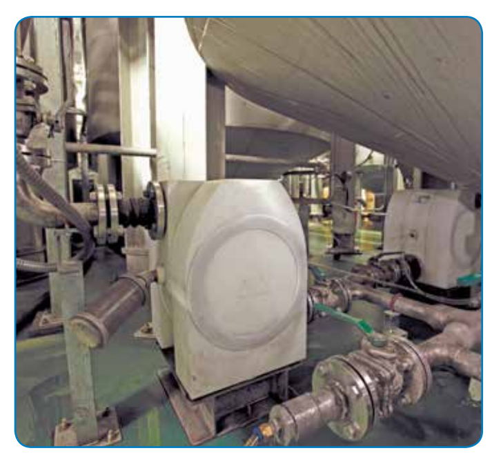
\label{eq:almatec} \textbf{Almatec}^{\circledast} \, \textbf{E-Series AODD Pumps used for transferring slurry in the solar industry.}

of sodium, potassium and calcium, which allow the glaze to melt; alumina, which stiffens the glaze and prevents it from running; colorants such as iron oxide, copper carbonate or cobalt carbonate; and opacifiers like zirconium oxide and tin oxide.