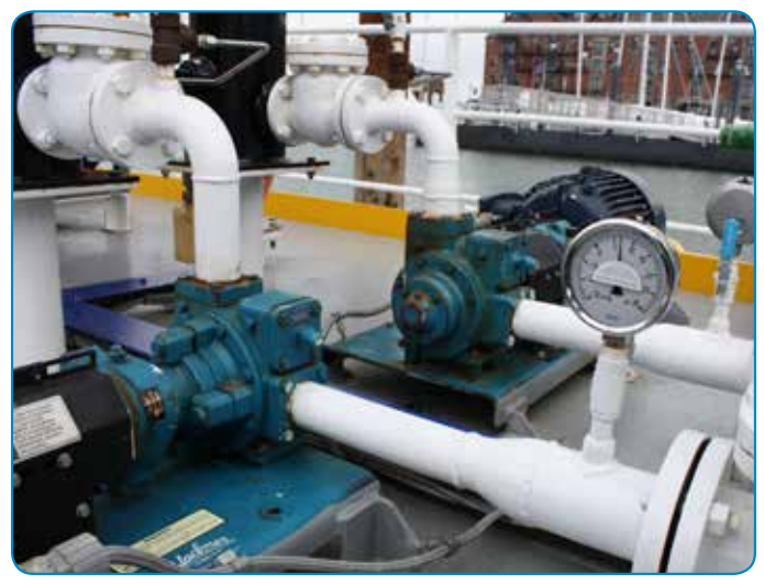
Harbor Fuel 1 is outfitted with Blackmer GX & X Series pumps, a 2-1/2-inch model for highcapacity fuel transfer, and a 2-inch version for operations that require lower flow rates.

Specifically, Harbor Fuel 1 is outfitted with a 2-1/2-inch GX Series pump that can deliver high-capacity flow rates up to 121 gpm (461 L/min) and a 2-inch X Series model that delivers 70 gpm (264 L/min) at lower speeds.