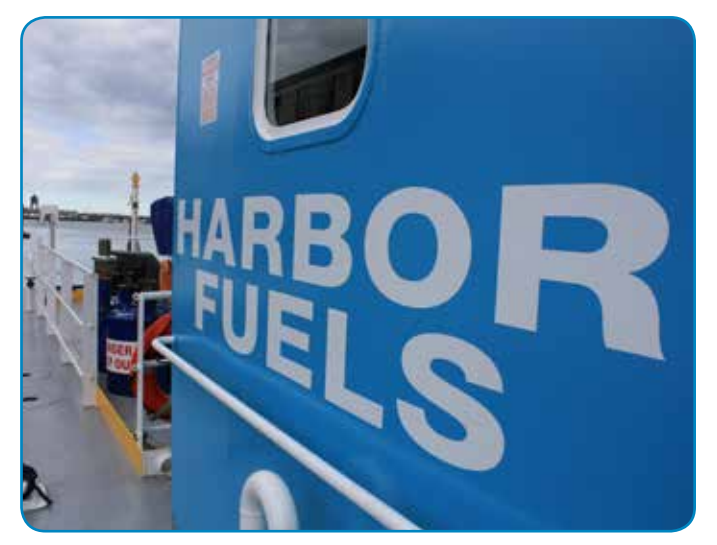
Harbor Fuels has built its reputation on providing safe, reliable fuel-transfer operations for vessels that traverse Boston Harbor. The use of Blackmer pumps has only helped to enhance that reputation.

"In the end, we recommended Blackmer pumps for this application because of their high efficiencies and performance throughout the lifetime of the pump," added Trask. "In fuel-transfer applications, whether on a barge or a truck, Blackmer pumps always stand out due to their high efficiencies and longevity."