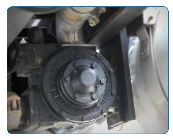
Blackmer® TXD Series Sliding Vane Pumps have always answered the call for Cape Cod Oil and Loud Fuel.

Mike and Kabraul Tasha aren't afraid to try new things – from acquiring new oil companies to introducing a new fuel to the Cape, such as biodiesel. But there's one thing they won't change – all of their trucks will have Blackmer TXD Series Sliding Vane Pumps on them.