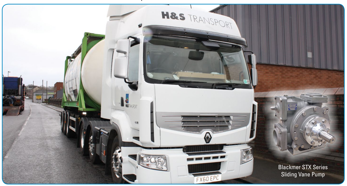
H&S Transport recently upgraded to Blackmer's STX Series pumps due to their suction and performance capabilities.

The bane of any business that relies on transport vehicles to deliver commodities to the end-user – from molasses to cement to LPG to bottles of milk – is an inefficient use of time. This use of time ranges from the period vehicles are not on the road making deliveries, due to equipment failures or maintenance needs, to the amount of time needed to load or unload a transport trailer. Transport companies that do not make the best use of their time, both on the road and at the loading dock, can be harmed on a number of levels. This harm can occur through elevated equipment costs, excessive maintenance charges, inability to meet promised delivery times and unacceptable transfer times, all of which can lead to a loss of reputation that can hamper future business opportunities.