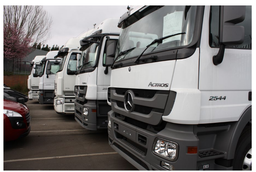
H&S Transport has more than 250 transport trucks in operation.

"We've been distributing Blackmer equipment for more than 40 years and we like to think that it's been a very successful relationship in that time," said Allcock. "The relationship between the manufacturer and distributor is very much a two-way thing, and they treat us as a business partner, not just as distributor and customer. Also, Blackmer quality is second-to-none, with a good market footprint and a great reputation for what they do. We're also the first port of call for a lot of their new lines of equipment. Blackmer is aware of our position in the U.K. and quite keen to send us equipment to test first."