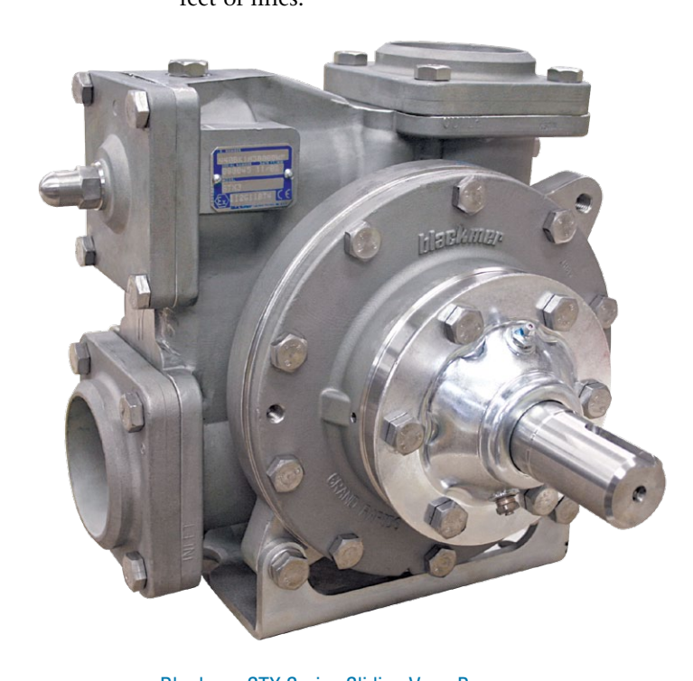
Blackmer STX Series Sliding Vane Pump

"It's a simple piece of equipment that gets mounted on the chassis and you don't think about it anymore," he said. "The STX3 can discharge 30,000 liters (7,925 gallons) in 38 to 40 minutes, which is tremendous, and when you need to do that five times a day, you need all the time you can get. One other thing with the STX pump – it clears the lines afterwards. Most pumps, when you discharge and when the tank is empty, don't clear the line so we had to use extra air lines to remove the product from the lines. The STX will clear 40 to 60 feet of lines."