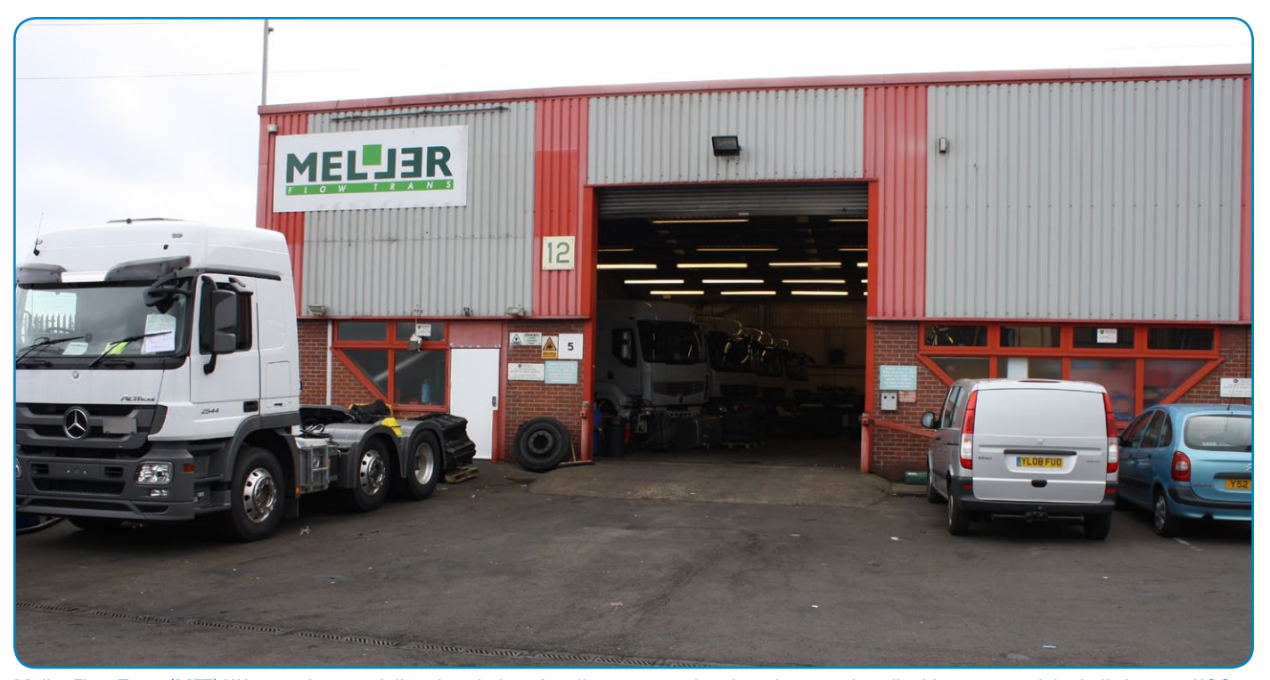
Meller Flow Trans (MFT) UK operation specializes in solutions for all transport-related products such as liquids, gases and dry bulk. In 2009, H&S Transport came to MFT for a recommendation for reliable chemical transfer pumps. MFT recommended the Blackmer STX Series, and H&S Transport has been extremely happy with that decision.