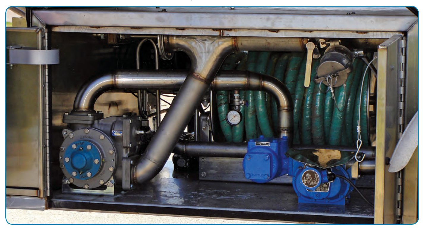
Transport companies are able to tap into the emerging Diesel Exhaust Fluid (DEF) market and delivery bulk quantities of DEF with the help of the new Blackmer line of STX3-DEF sliding vane pumps.