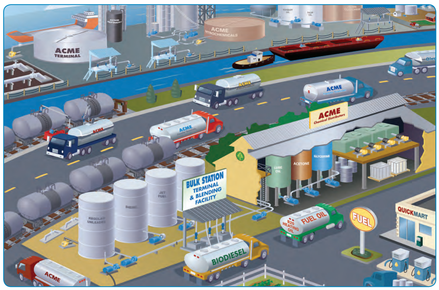
Throughout the supply chain, it's common for a small amount of a specific shipment to miss its final destination. This is because a "heel" is often left in the barge, railcar or tanker. While it is nearly impossible to get every last drop out of the delivery vessel, sliding vane pump technologies can remove as much of the shipment as possible during delivery.