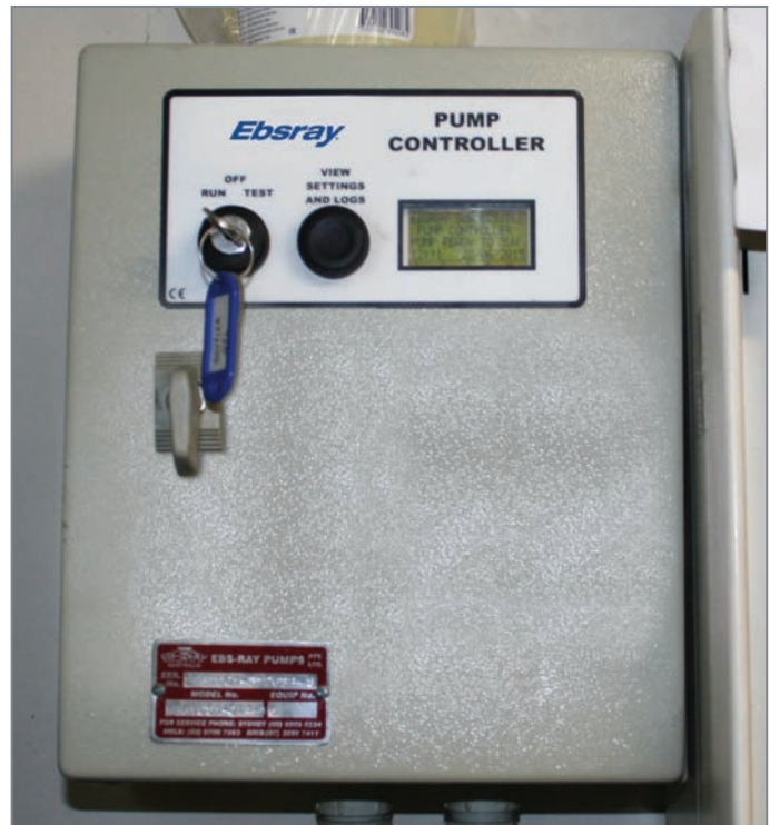
The Ebsray® Pump Controller ensures the pump performs within the specific duty parameters while monitoring temperature, pressure and motor current.

The Ebsray RX10 pumps meet the needs of Antargaz because they have been designed for low-flow, high-head duties on low-viscosity liquids such as Autogas. Specifically, the RX10 model has been precision-built for efficient high-pressure pumping of Autogas from underground or above ground storage tanks. The pumps are fully submersible inside the storage tank, which helps enable Antargaz to install the entire storage system below ground, which results in the clean look that is demanded by French fueling-site regulations.