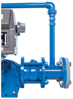
Centrex Multi 2 M (Meter)