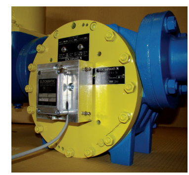
▲ Centrex Multi 2 ME (Electronic Meter)