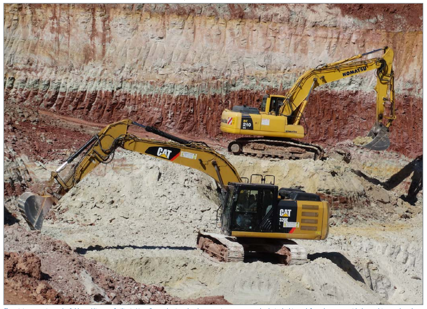
The mining operation at the Sables et Mineraux facility in Livry, France, begins when heavy equipment extracts the desired white rock from the quarry, with the resulting sand used as a component in cement. Disposing of the wastewater created during the cleaning process is a critical operation, and the company has optimized that wastewater-removal process through the use of an Abaque® HD100 Series Peristaltic (Hose) Pump.