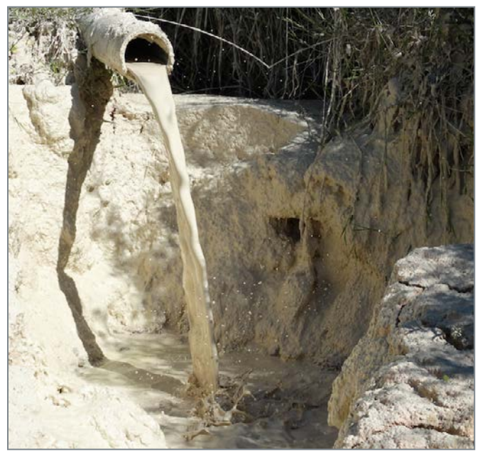
After traveling 800 meters, or half-a-mile, the muddy wastewater is discharged into a retention pond. After the mud settles, the clean water at the top of the pond is reclaimed and reused in the mining process, which helps satisfy the mine's goal to operate in an environmentally safe and sensitive manner.