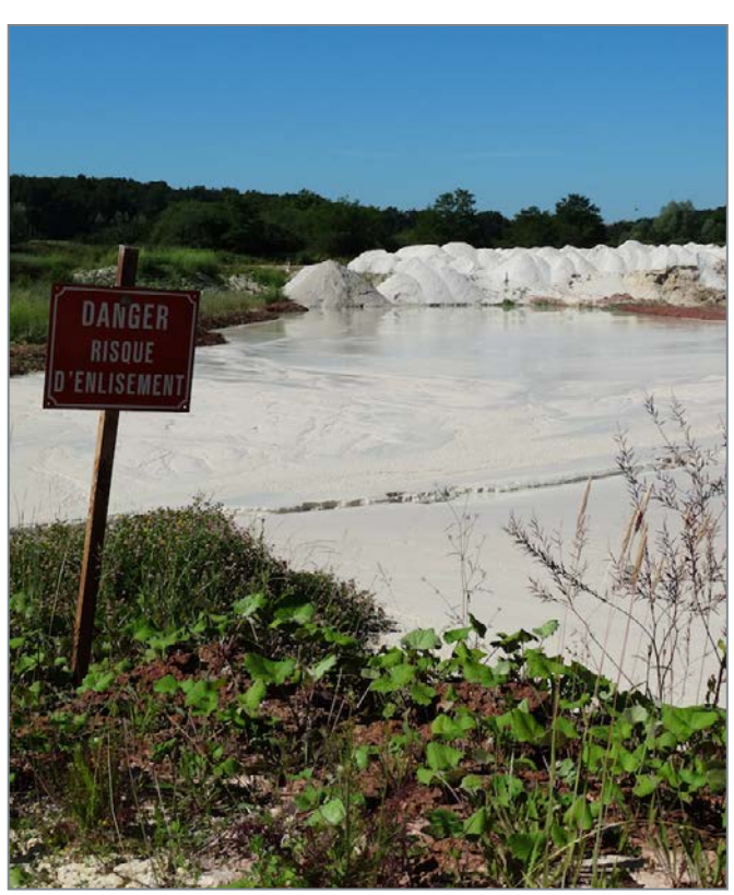
The highly viscous nature of the wastewater at the Sables et Mineraux mine is attested to by the warning sign at the facility's retention area: "Danger: Risk of getting bogged down" it reads, an admonition to avoid stepping into the quicksand-like substance.

The conveyors transport the gravel to the grinders in the processing center where it is ground down into a less-course sand and cleaned before it is placed in piles where the sand waits to be loaded onto the trucks of the companies that contract with Sables et Mineraux for the commodity. When the Livry facility opened, an average of two trucks a day arrived to haul away the sand, but as of June, a steady stream of 20 to 25 trucks a day were flowing into and out of the facility, or roughly three an hour.