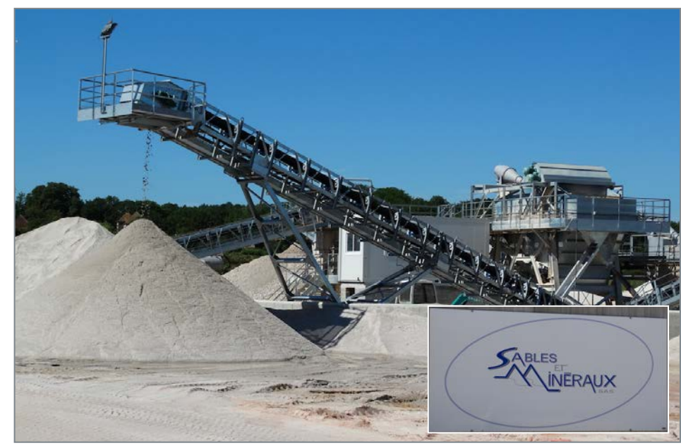
The processing center at the Sables et Mineraux facility turns "big rocks into little rocks" and relies on an Abaque® HD100 Series Peristaltic (Hose) Pump to dispose of the wastewater that is created during that process.

In other words, the HD100 Series is the perfect pump for the needs of Sables et Mineraux. Since its installation, the HD100, which is also outfitted with a pulsation dampener to protect against product surges that can damage the discharge piping, has performed continuous duty consisting of 16 hours a day, five days a week. At peak operating levels, the pump will transfer upwards of 35 to 40 m<sup>3</sup>/hr (154 to 176 gpm) of viscous wastewater to the faraway retention pond. And it has done it without suffering any service interruptions that would hamper the facility's production schedule.