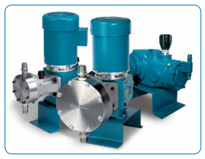
Neptune™ 7000 Series Mechanical Diaphragm Metering Pumps are ideal for dosing alum and ferric chloride because they do not feature contour plates on the liquid side of the diaphragm, resulting in a simple, straight-through valve and head design that allows improved flow characteristics.

A wide variety of industries use untold millions of gallons of water and produce untold millions of gallons of wastewater each and every day. Properly handling and disposing (or reusing) this wastewater requires a number of stages that must work together seamlessly, from alum and ferric chloride introduction, to polymer injection, to sludge removal. Each stage requires a different type of