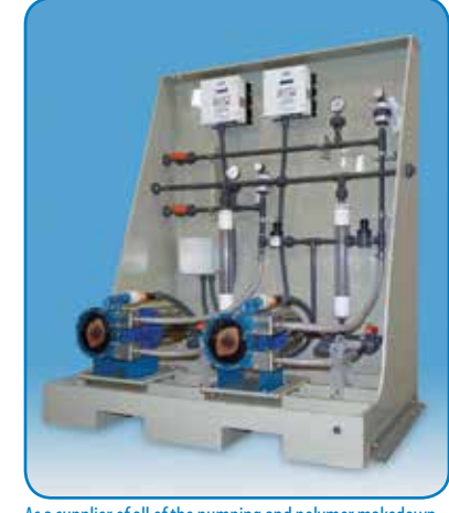
As a supplier of all of the pumping and polymer makedown equipment needed for a water-treatment system, Neptune™ has the capability to create pre-wired and pre-piped skidmounted arrangements.

However, Neptune<sup>™</sup> Chemical Pump Co., North Wales, PA, USA,