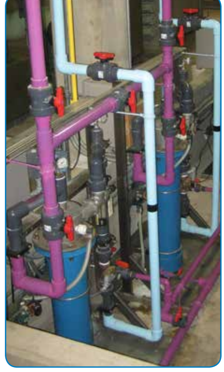
dynaBLEND™ Liquid Polymer Blending Systems from Fluid Dynamics™, a division of Neptune™, feature a non-mechanical mixing chamber that allows an unequalled degree of reliability when activating all types of liquid polymer for use in water or wastewater treatment.