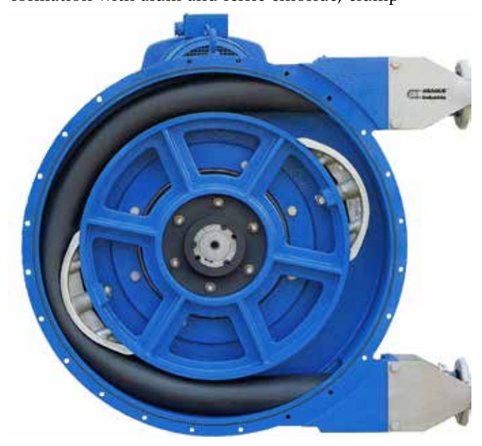
Abaque® Peristaltic (Hose) Pumps play a pivotal role in sludge removal during a wastewater-treatment operation thanks to their ability to run dry and effectively handle abrasive, particle-laden materials.

Industrial water or wastewater treatment, then, is a threestage process that must work hand-in-hand: initial floc formation with alum and ferric chloride, clump-