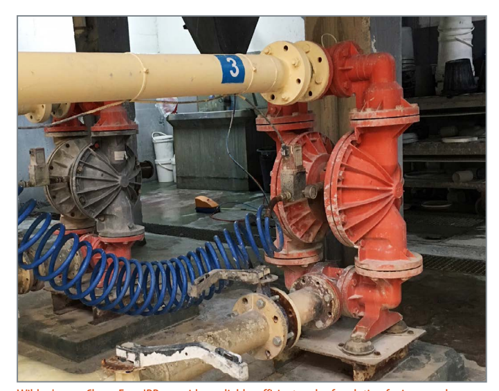
Wilden's new Chem-Fuse IPDs provide a reliable, efficient and safe solution for improved diaphragm performance, even in the harshest fluid-transfer applications.