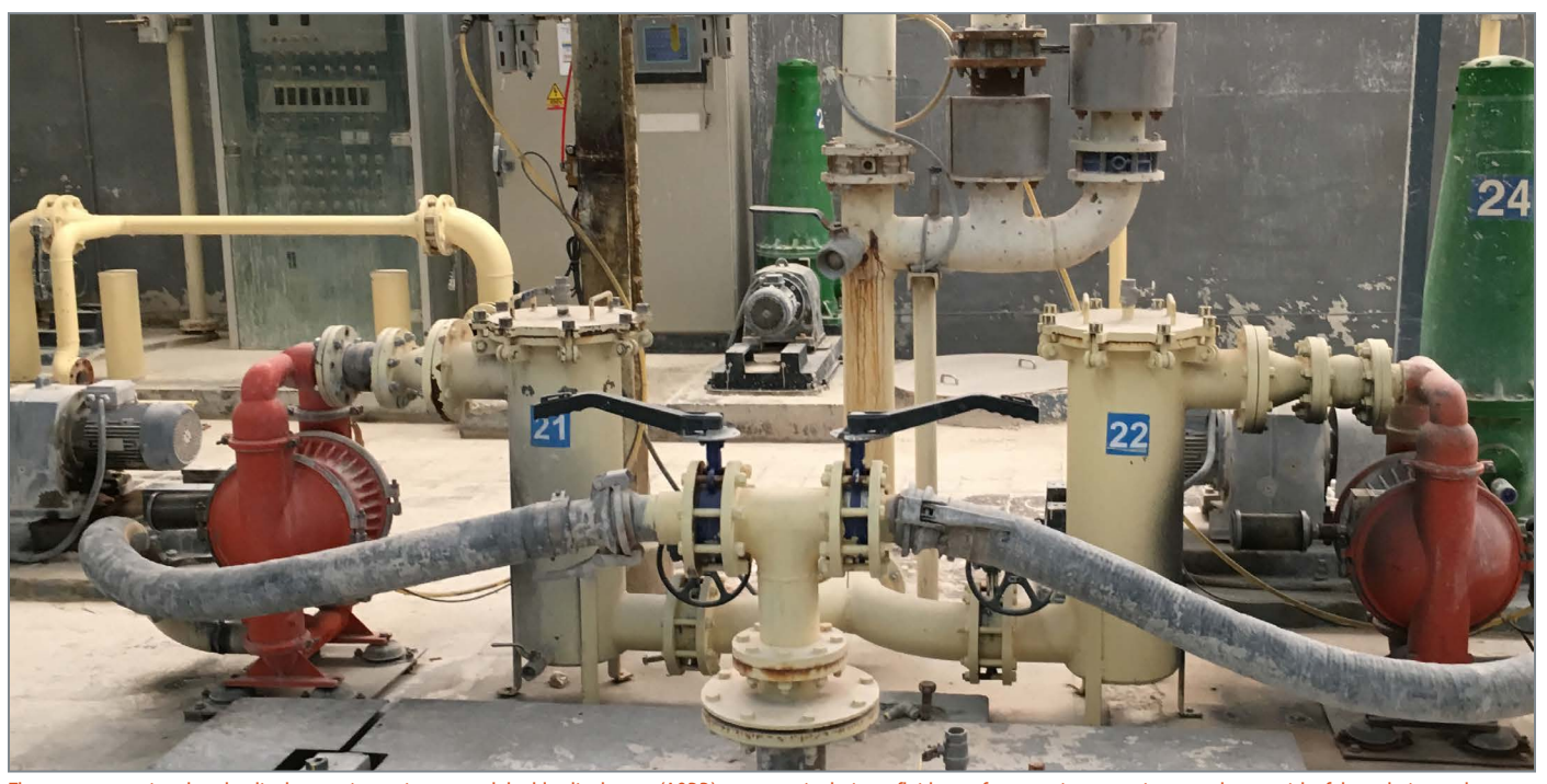
The constant motion that the diaphragms in an air-operated double-diaphragm (AODD) pump are in during a fluid-transfer operation operation puts them at risk of degradation and breakdown. However, a new integral piston diaphragm (IPD) design protects the diaphragm from failure while still delivering expected flow rates, efficiency, consistency, abrasion resistance and operational safety.