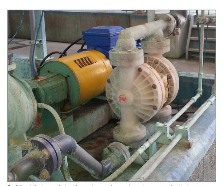
Traditional diaphragm designs feature inner and outer plates that connect the diaphragms to the pump shaft. While this design does have its operational benefits, there are some shortcomings that can lead to the creation of leak points that can affect product containment, which is especially critical when handling dangerous or hazardous materials.

Taking into account the problems that abrasion wear and material buildup can cause, the industry worked diligently to develop the integral piston diaphragm, or IPD. Within the IPD design, the piston that is used to move the diaphragm laterally during the pumping stroke is encapsulated into the interior of the diaphragm itself. IPDs also have a smooth finish with an angle of operation that enhances fluid flow and suction lift while reducing the propensity for material buildup on the outer piston.