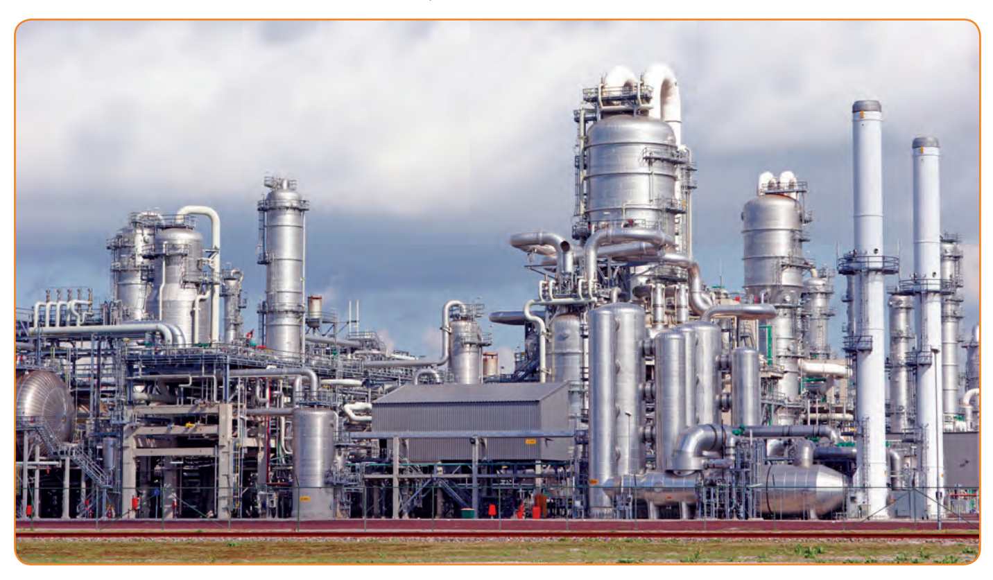
Chemical plants contain many transfer points in their operations where air-operated double-diaphragm (AODD) pumps with the latest Air Distribution System technology can be deployed to optimize flow rate and air consumption.