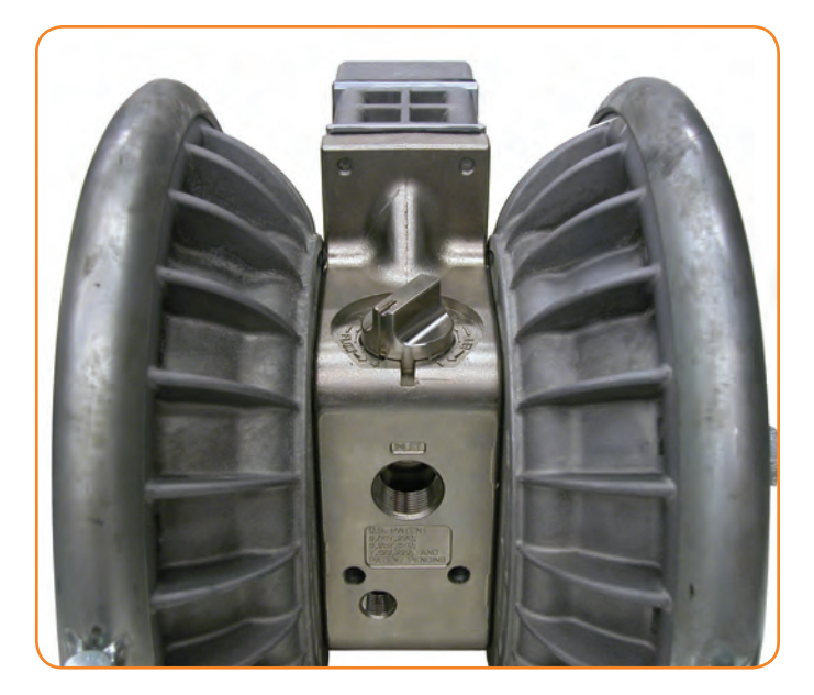
Wilden's Pro-Flo X<sup>™</sup> air distribution system (ADS) provides top-of-the-line operational flexibility through its patented Efficiency Management System (EMS<sup>™</sup>) that allows the user to optimize the ADS for any application demands regardless of pump size through the use of a control dial that allows the user to select the flow rate that best suits the application.

reliable way to measure air consumption. This means that they will need to conduct air tests in order to determine the amount of air that is being consumed at a specific flow rate. This can be a time-consuming process, but the ultimate payoff will be realized in the reduced cost to operate a more efficient pump.