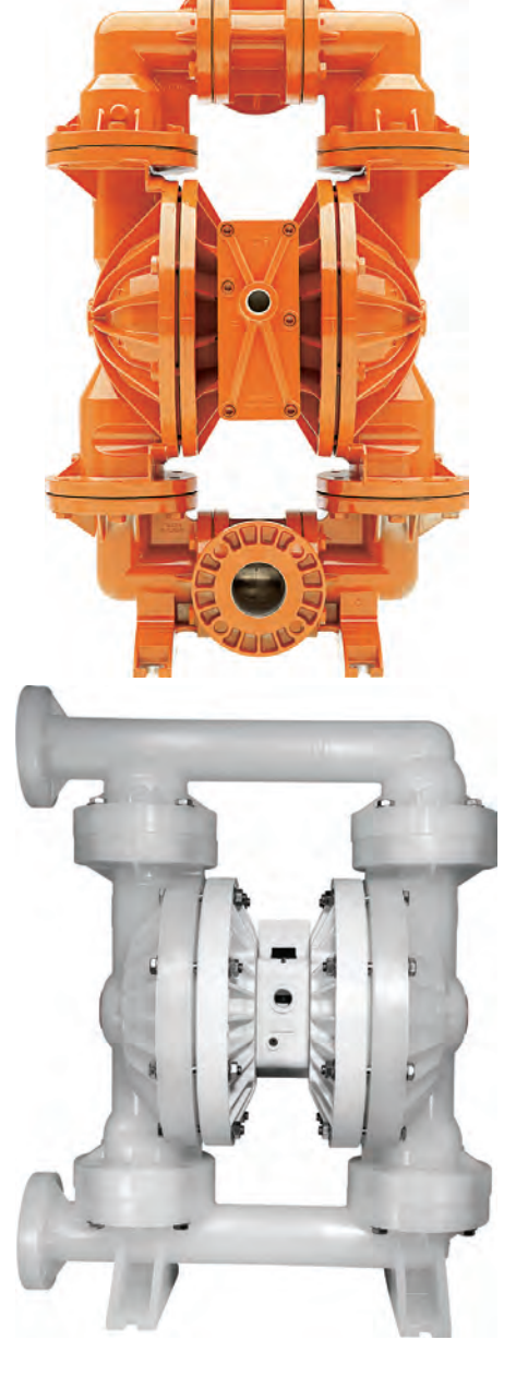
To make it as easy possible for the pump operator to find the proper setting for the application, Wilden has created the See More Green website. Found at <u>www.wildenpump.com/</u> <u>seemoregreen</u>, the website has been designed to let the operator quickly and reliably identify the best EMS settings for his varying fluid-transfer operations.

But the best system can only operate at its utmost efficiency if the operator is willing to take the time to find the "sweet spot" in its operational curve. With this in mind, the simplest, most effective way for plant operators to find the perfect marriage between optimal flow rate and the most efficient use of air in their AODD pumps is to embrace and utilize the most beneficial features of their ADS technology.